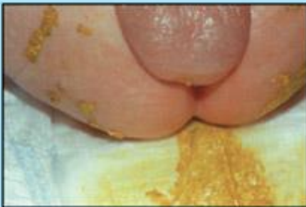
Poop can look seedy.