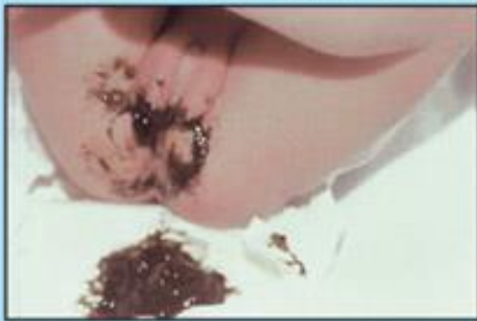
The baby's first poop is black and sticky.

The baby's poop should change color from black to yellow during the first 5 days after birth.