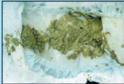
The poop turns green by Day 3 or 4.