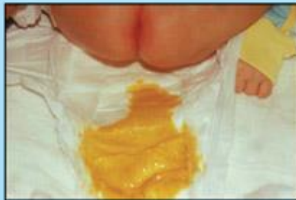
Poop can look watery.